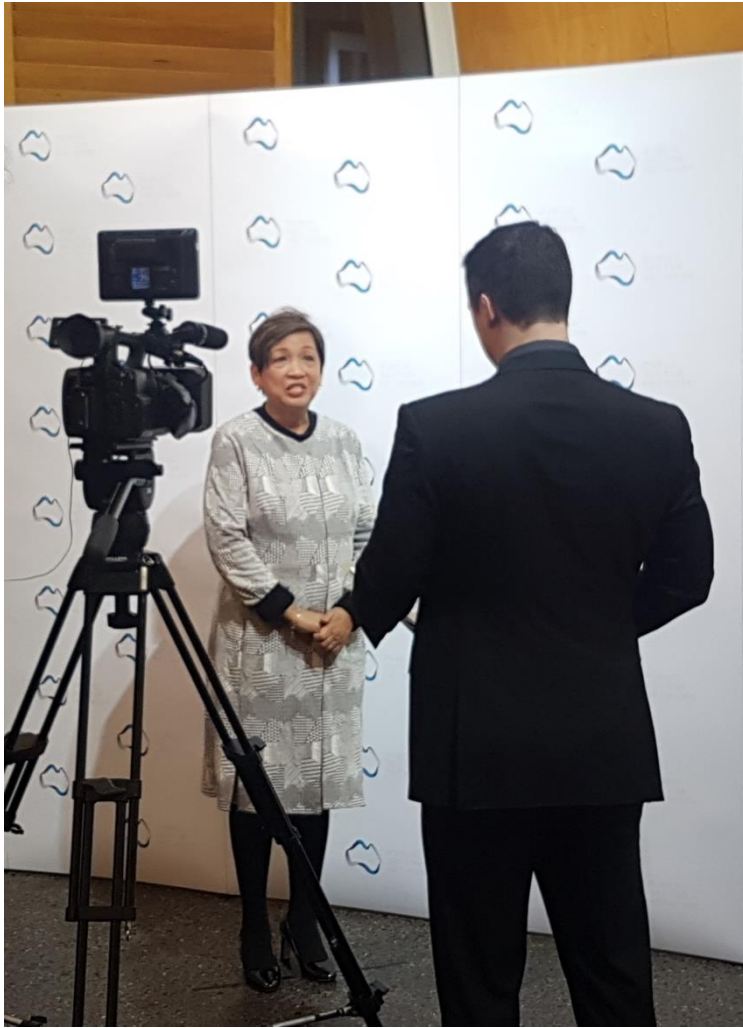
Ambassador Minda Calaguian-Cruz talks about the biggest concerns to global security during a post-interview at the Australian Security Summit.