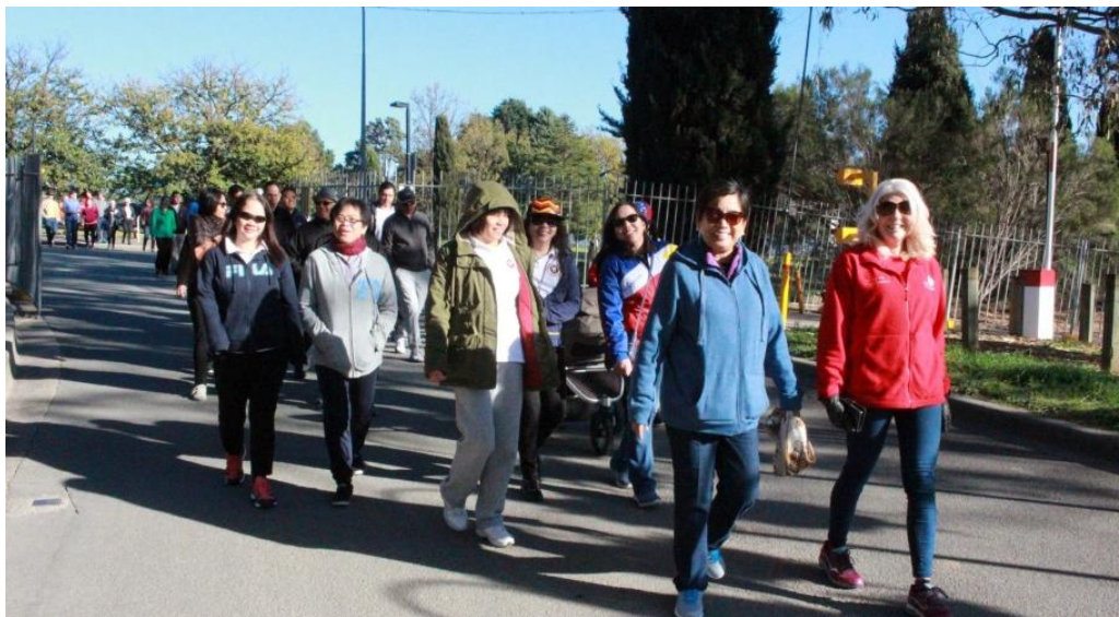
H.E. Minda Calaguian-Cruz, Philippine Ambassador to Australia, leads the Philippine Embassy for the Walk of Nations at Floriade in support of the Heart Foundation ACT, 14 October 2016

14 October 2016 –Philippine Ambassador Minda Calaguian-Cruz led the Philippine Embassy in the Walk of Nations at Floriade in Canberra, Australia on 14 October 2016. The Philippine Embassy joined several other Embassies on a 45-minute early morning walk around Floriade, Canberra’s biggest flower festival held annually.