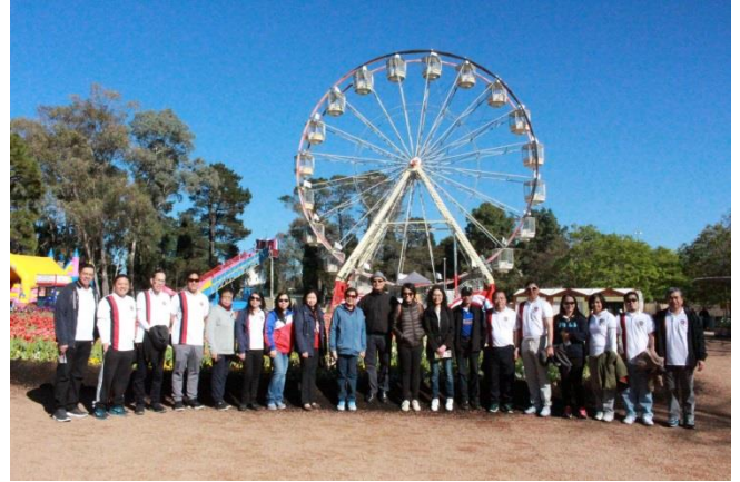
The Philippine Embassy team supporting the Walk of Nations, 14 October 2016.