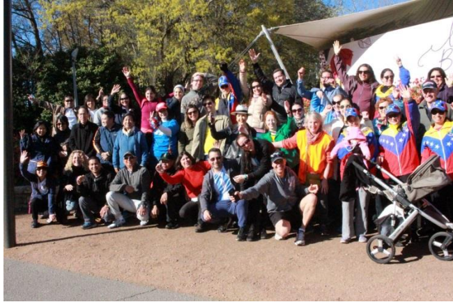
The Embassies in Canberra participating in the Walk of Nations, 14 October 2016.