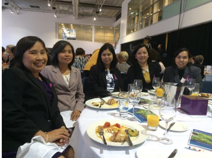
The Philippine Embassy ladies joined women all over the world in marking International Women’s Day (IWD) by attending the IWD lunch organized by UN Women Australia at the National Convention Centre on 5 March 2015.

Over 1,200 people attended the IWD event.